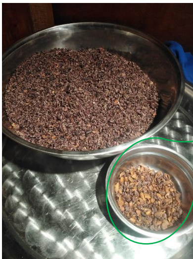
Nib / husk mix