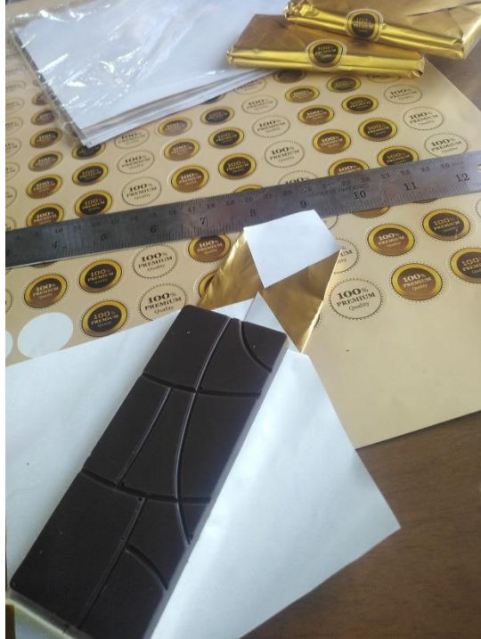
Figure 5: Premium Retail Sales