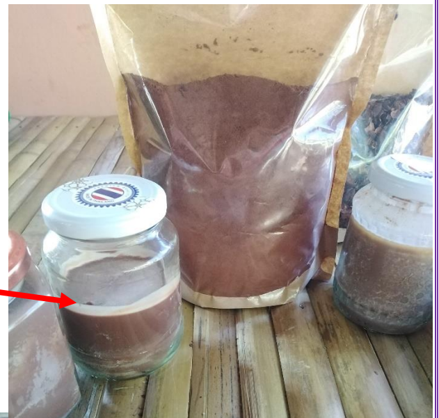
Unrefined raw cacao butter